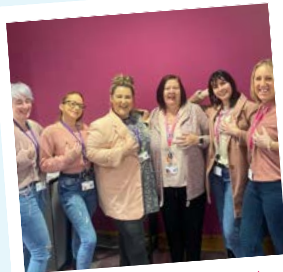
WEAR IT PINK DAY