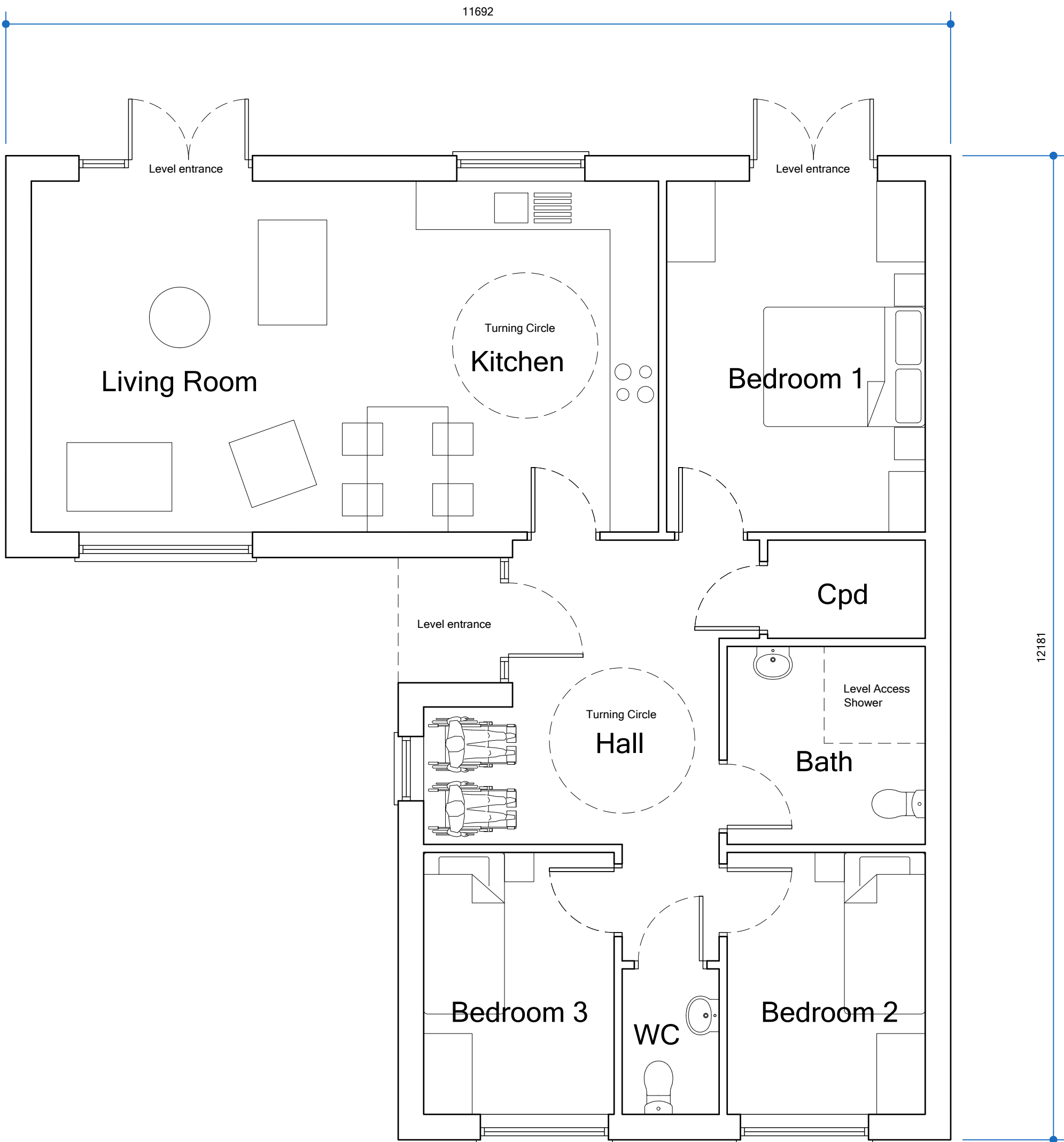
Three Bedroom Accessible House Type - 90.40m2 GIA

Scale Bar - 1:1 0mm 25mm 50mm 75mm Notes - Drawing copyright of Ross Davy Associates - Used figured dimensions only, do not scale from this drawing - All materials specified are to be used in strict accordance with manufacturers written instructions and current codes of practice - Should the project fall under the scope of the Equality Act, Party Wall Act or the CDM Regulations, it is the Employer's responsibility to initiate the following: - Disabled Access Audit - Party Wall Notice and Surveys (if required) - Pre-Construction Health and Safety Plan - These drawings are to be considered as Preliminary and for information only until technical approval has been obtained from the relevant Local Authority/Approved Consultant. Commencement of work on site prior to these approvals is at the Client's/Contractor's risk. Inspections and Surveys Where elements of the construction are not visible during the survey, it is the contractor's responsibility to identify structural elements such as floor joist spans and supporting structures, prior to any demolition works and inform client / architectural consultant. Additional works may therefore be necessary. Our survey does not include any destructive investigation.